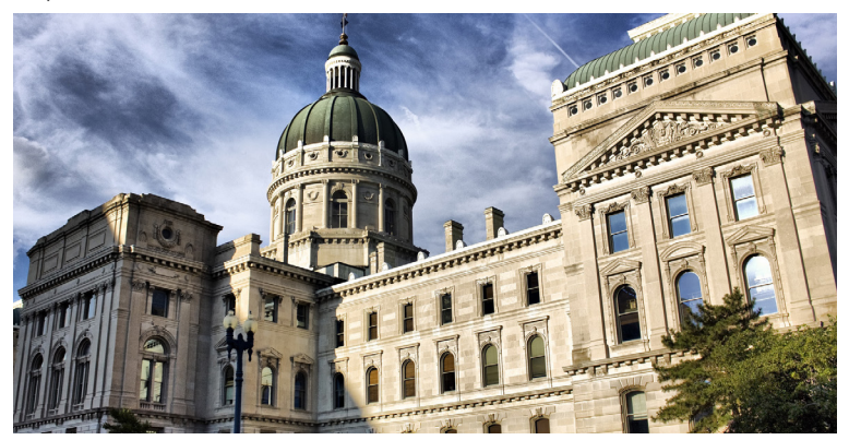
THURSDAY, AUGUST 24

How Vulnerable are American Communities to Automation, Trade, and Urbanization? 9:30 a.m. - 10:30 a.m.